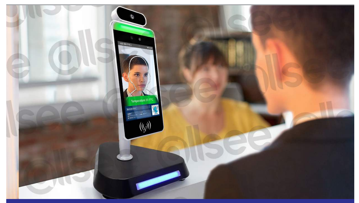
Protect staff and customers using our temperature checking, mask detection and facial recognition solution with software included