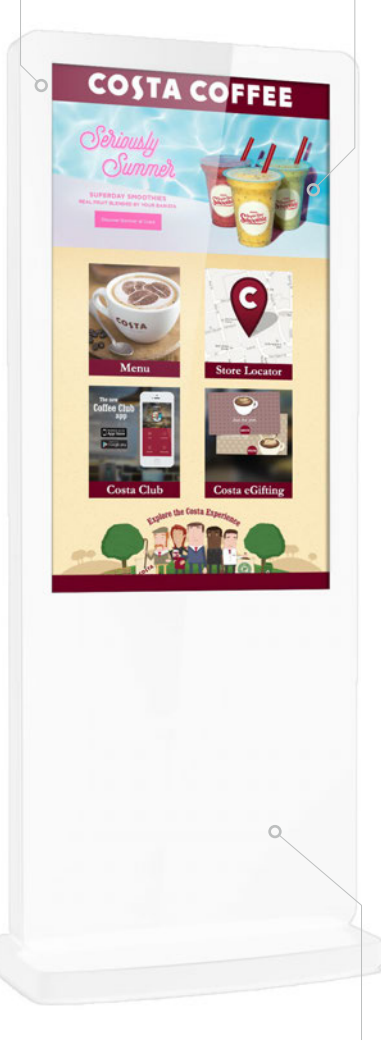
NO EXTERNAL PC REQUIRED