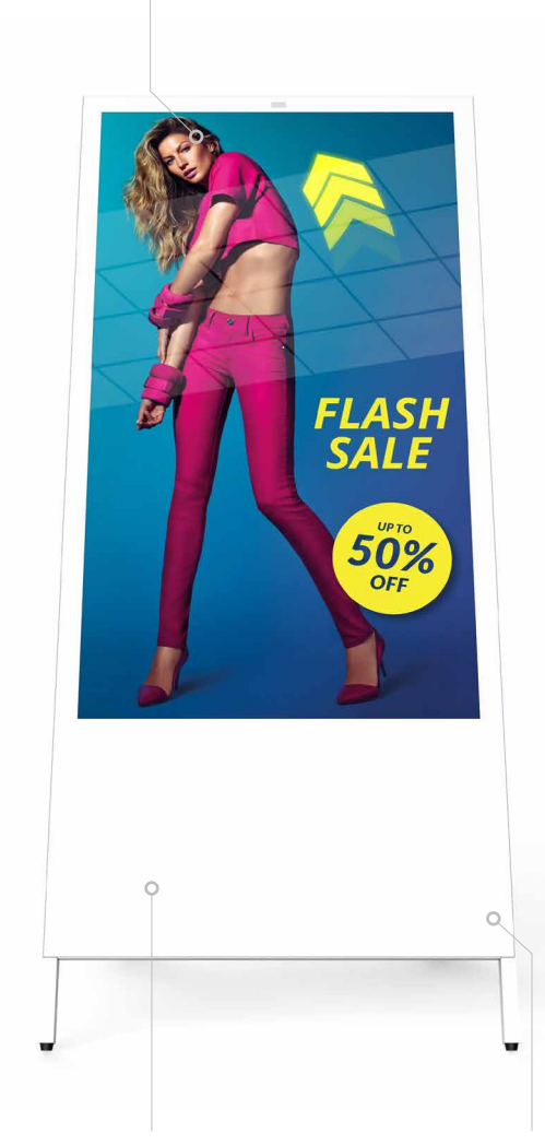
INTEGRATED ANDROID MEDIA PLAYER