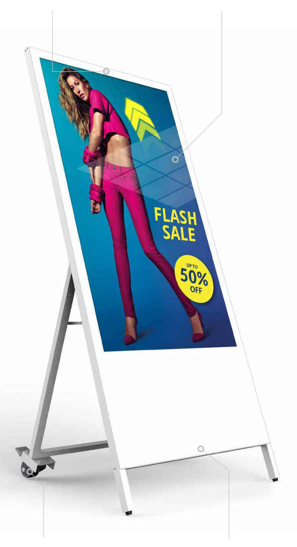
FIXED LOCKABLE CASTORS